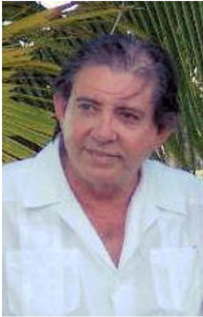
Joao Teixeira de Faria, known as John of God World-Famous Healer

John of God is without a doubt one of the most powerful and successful healers alive today. Through John of God, a full trance medium, more than 35 spirit guides minister to hundreds of people who visit him daily from all over the world. They come to the Casa de Dom Ignacio in Abadiania, Brazil, for healing on spiritual, mental, emotional, and physical levels. The Casa, as it is simply called, is a sacred site named for the primary spiritual entity, St. Ignatius de Loyola, founder of the Jesuits.